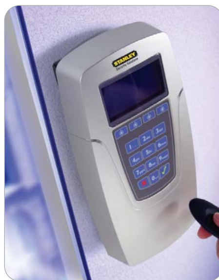
Pay Period Report